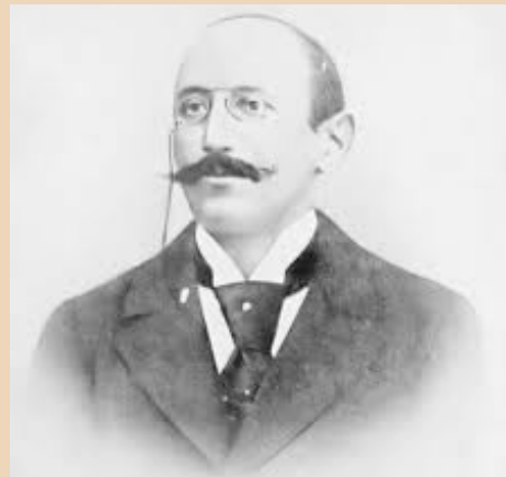
Alfred Dreyfus (1859-1935)

My three studies of Alfred Dreyfus and his family are based on analysis of books about them as well as on letters Alfred exchanged with his wife Lucie while he was kept in solitary confinement and imposed silence on Devil's Island. The letters yield more than historians have seen so far. Commentators have made nothing of the lack of sequence, the absence of narrative, and the repetition of words, phrases and cries of painful loneliness. They have overlooked the intimacy of the couple's love, their discussions on education, and their mutual dependence on their two families, Alfred's own and Lucie's Hadamard connections. These