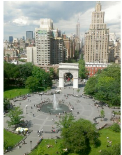
View of Washington Square Park from the IPA convention venue

The program for our 37 th annual convention consists of a diverse group of scholars, each with a unique contribution to our continually expanding knowledge of cultural, historical and societal motivations. 50 presentations are scheduled over the three day period with featured speakers on Wednesday June 4 and three continued on page two